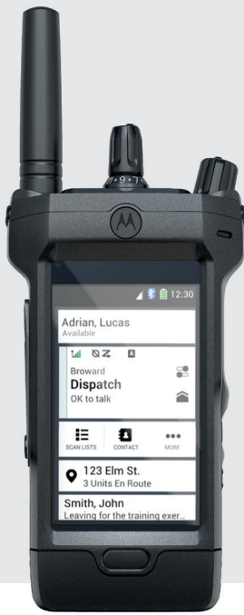
Access from the home screen