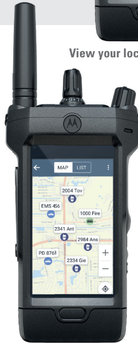
See other unit locations