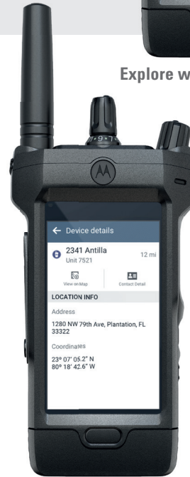
Tap to communicate with team members

For more information, please visit www.motorolasolutions.com/smartmapping