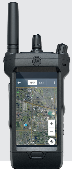
Explore with aerial imagery