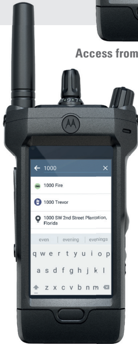
Search for units or locations