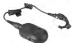
Operations Critical Wireless Earpiece

“When I first saw the MOTOTRBO SL Series I thought that it was a cell phone, not an actual two-way radio. It has all the capabilities of a two-way radio but with a professional, discreet look that fits absolutely well with all our uniforms.”