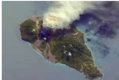
Soufrière Hills volcano activity, Montserrat – International Space Station 2009 photo.

Agencies such as police, airport, hospital and the Red Cross, as well as department heads from Government agencies are managed from the Emergency Operations Center in case of a disaster or emergency. Therefore, this MOTOTRBO Digital System deployment helps ensure all agencies are able to communicate at all times.