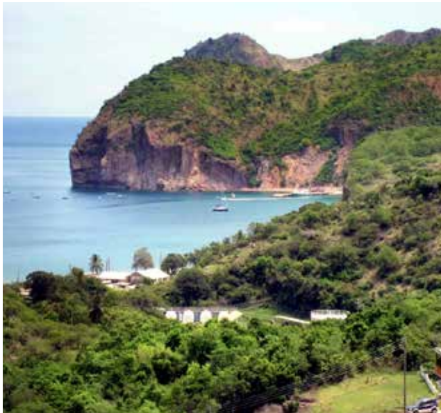
Montserrat's Little Bay, site of the new capital.