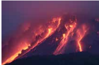
Soufrière Hills volcano, Montserrat.