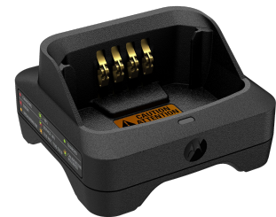
IMPRES 2 SINGLE-UNIT CHARGER