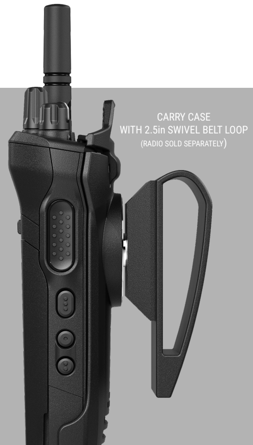
CARRY CASE WITH 2.5in SWIVEL BELT LOOP (RADIO SOLD SEPARATELY)