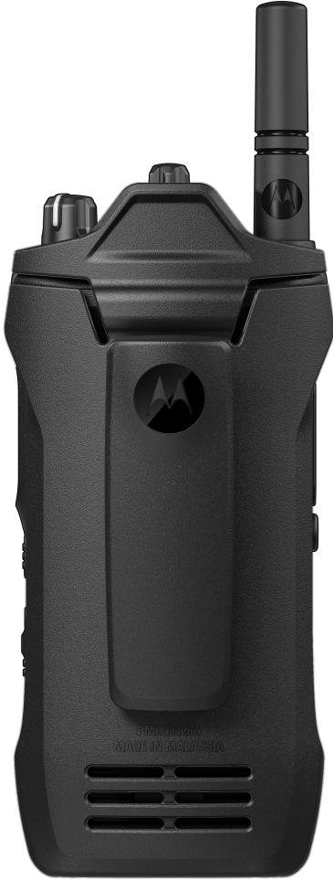
CARRY CASE WITH 2.5in FIXED BELT CLIP (RADIO SOLD SEPARATELY)

Choose from plastic carry cases and belt clips, all designed for easy yet secure access to the MOTOTRBO Ion radio when wearing it on the waist or hip - so your team can stay hands free and focused on the task ahead.