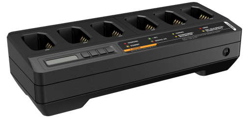
IMPRES 2 MULTI-UNIT CHARGER - 6 POCKET