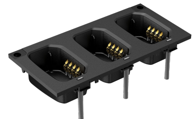
ION BATTERY ADAPTER FOR MOTOTRBO PMPN4284 MULTI-UNIT CHARGER