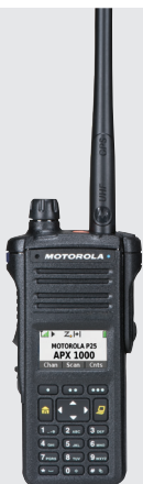
APX 1000 SIMPLE. EASY. MISSION-CRITICAL. Single-knob, single-band portable radio.