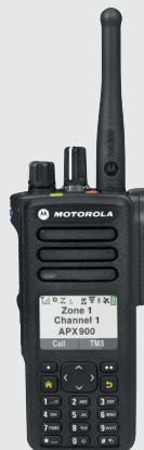
APX 900 ESSENTIAL COMMUNICATION. EXCEPTIONAL SERVICE. Dual-knob, single-band portable radio.