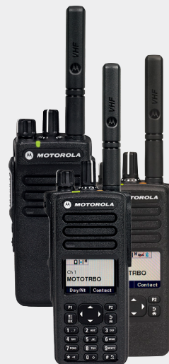
MOTOTRBO DP4000e Series