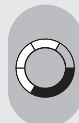
Volume Level 8