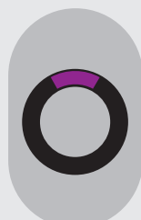
Purple Active Channel