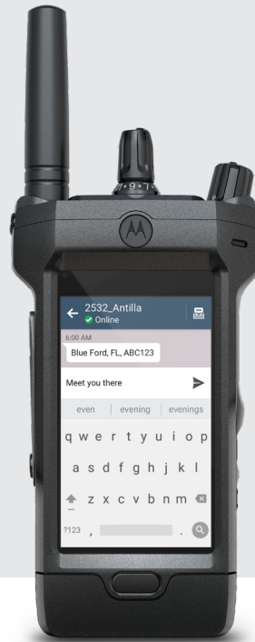
Create text messages quickly and easily