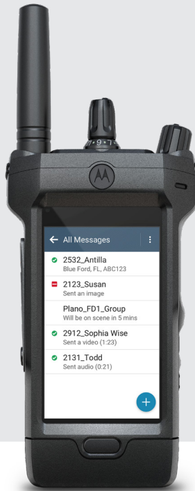
View status of contacts and groups