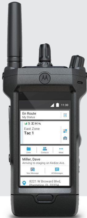
Access from the home screen