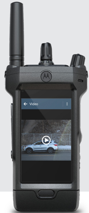
Share images, videos and voicenotes